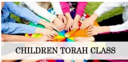
CHILDREN TORAH CLASS

Brit Hadasha: Mark 7:1-30; Romans 8:1-13; Hebrews 10:1-18, 13:10-16