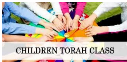
CHILDREN TORAH CLASS

Join us for praise, worship, Kids Torah class, Torah reading, midrash on the Parasha and Oneg (Food Fellowship; only Biblically clean food items)