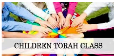
CHILDREN TORAH CLASS

Join us for praise, worship, Kids Torah class, Torah reading, midrash on the Parasha and Oneg (Food Fellowship; only Biblically clean food items)