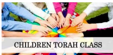
CHILDREN TORAH CLASS

Join us for praise, worship, Kids Torah class, Torah reading, midrash on the Parasha and Oneg (Food Fellowship; only Biblically clean food items)